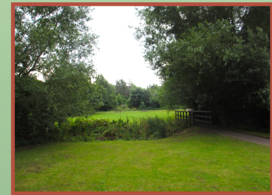
5. Millennium Green is an initiative by local people to provide an oasis of green space on former allotments

There are loads more hidden historical gems to be found in Acocks Green. Why not email us your stories at aghisthoc@hotmail.com ?