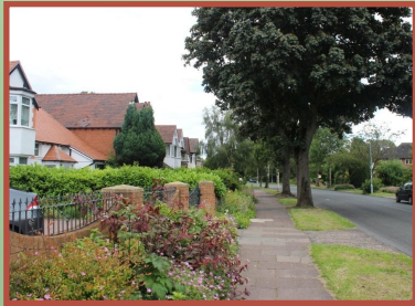
1. Hazelwood Road is an attractive alternative route to walk down. Do you know what the link is between this road and John F. Kennedy?