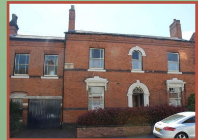
6. What reason might there be for Baskerville House on the Avenue having such a name?