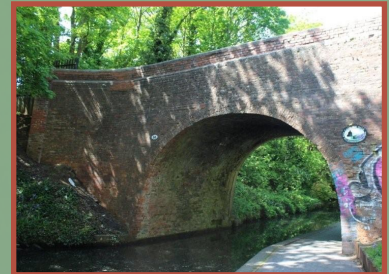
8. The canal bridge at Woodcock Lane is the only original one remaining in Birmingham on the Grand Union Canal, and is now statutorily listed.