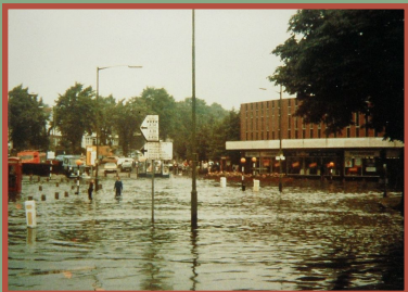
4. Much of the Green used to flood after heavy rain. This photograph from the 1970s shows what it looked like.