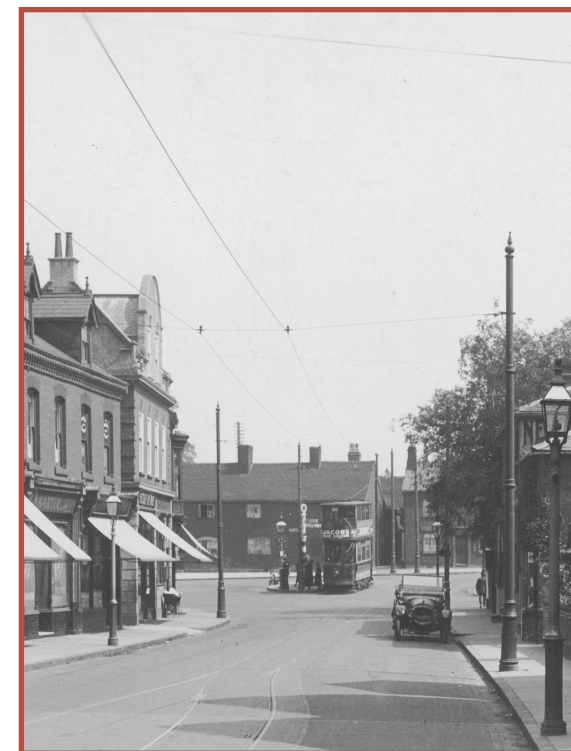
An early 1920s view of Acocks Green from near Dudley Park Road

This trail includes eight heritage information boards and pages on the Acocks Green History Society website.