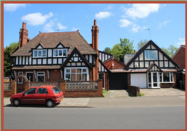
3. Why are the small Arts and Crafts style houses on Shirley Road there?