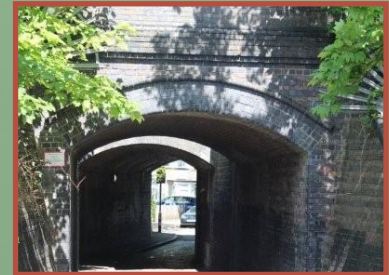
7. What is unusual about the railway bridge at Roberts Road?