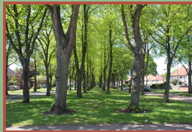
2. Why is Greenwood Avenue so wide?